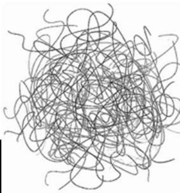
Self Portrait of Mind

category or reference point. These are the spaces that are traversed the most but unfortunately have been the ones too neglected the most in present times. Their importance lies in the fact that they not only have the