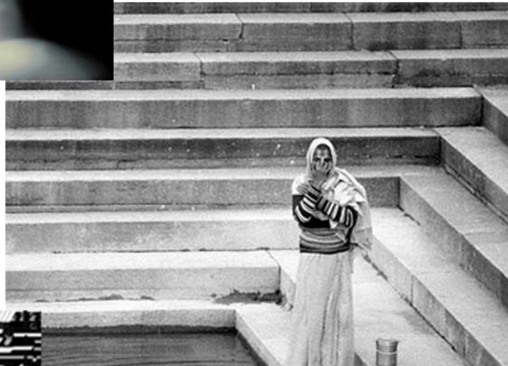
Hindu Pilgrim Bathing in Pushkar Lake