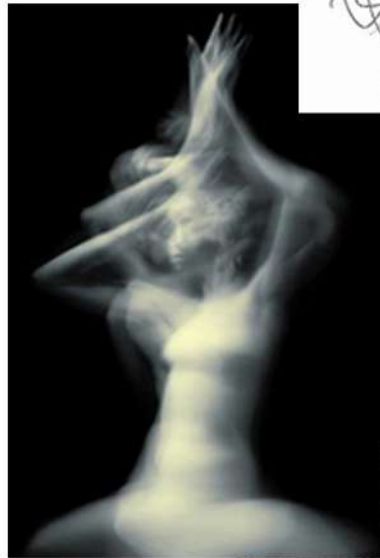
Movement Photography

ence of movement within a situation/project. Their Scale may vary from simply a passage within a dwelling to a street in a public realm.